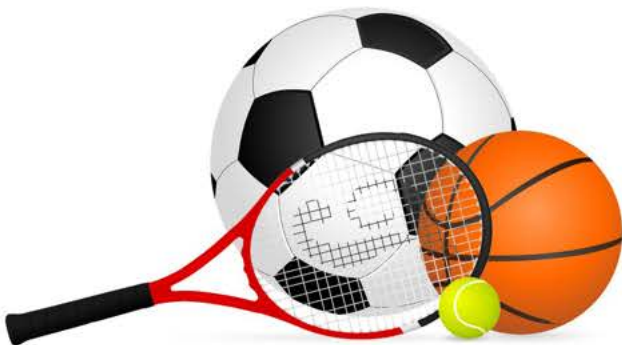
PE kit & Calculator