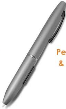
Pen, & Pencil